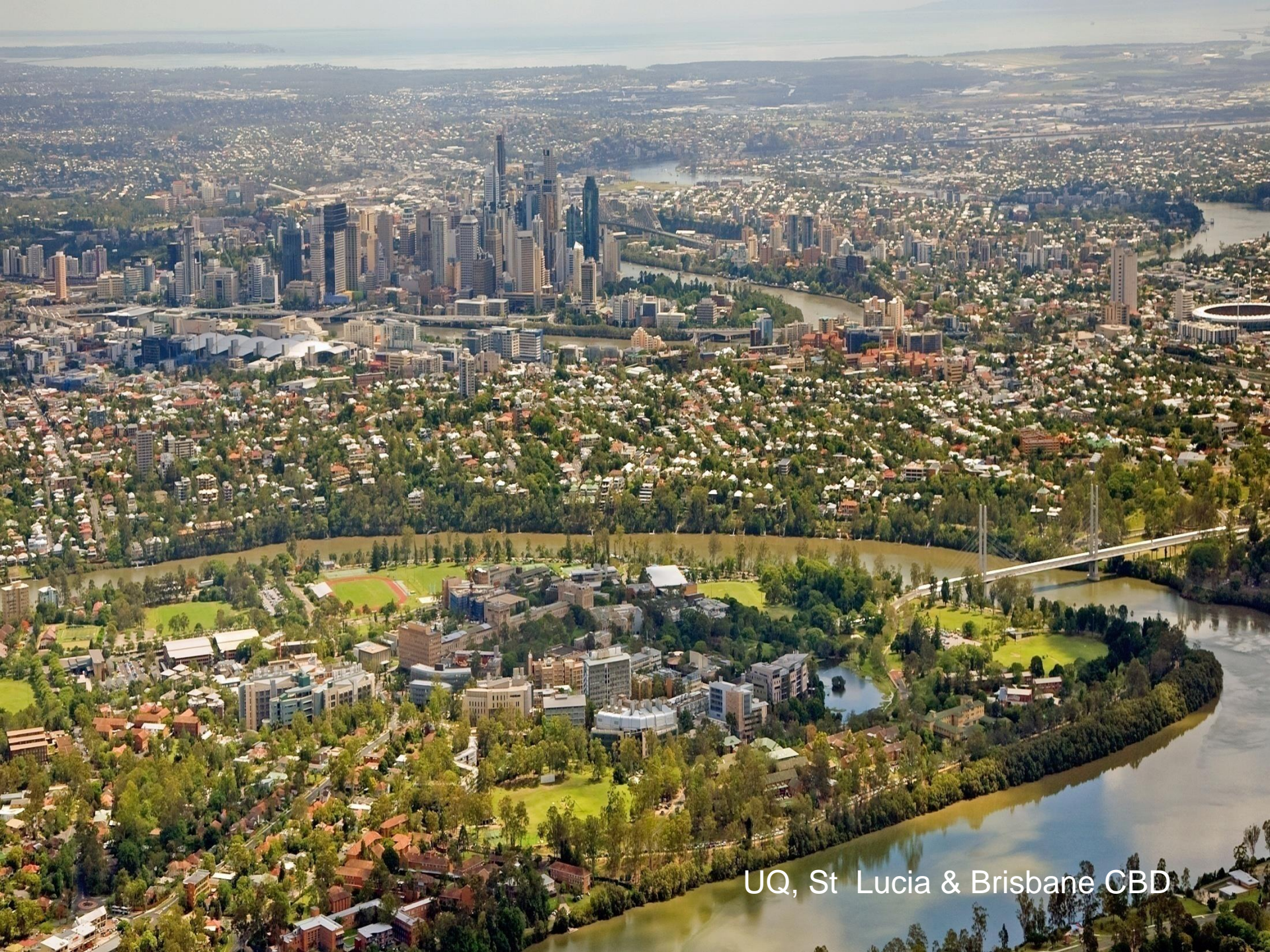
UQ, St Lucia & Brisbane CBD