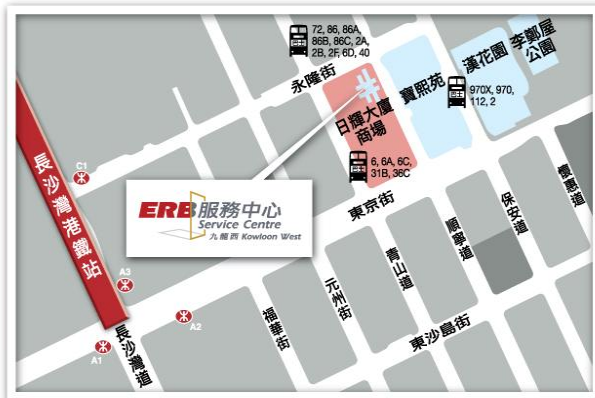
Cheung Sha Wan