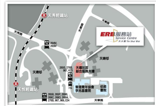
Tin Shui Wai