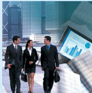
Business and Administration