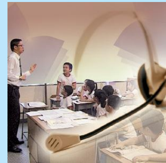
Education and Languages