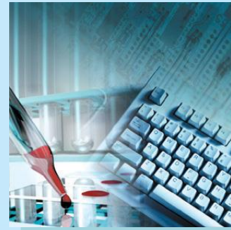
Science and Technology