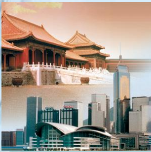
Arts and Social Sciences